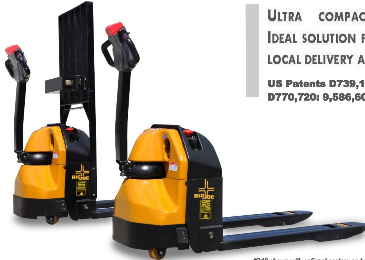
"D40 shown with optional casters and with and without 48" load back rest, tool tray & load restraint.

US Patents D739,112 : D770,719 D770,720: 9,586,605